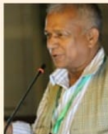
Ganesh Shaha Former-Minister for Environment, Science and Technology, Nepal.