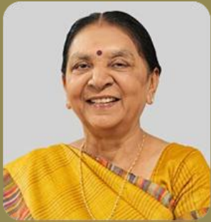
Smt. Anandi Ben Patel Hon'ble Governer MP, Chancellor BRAUSS